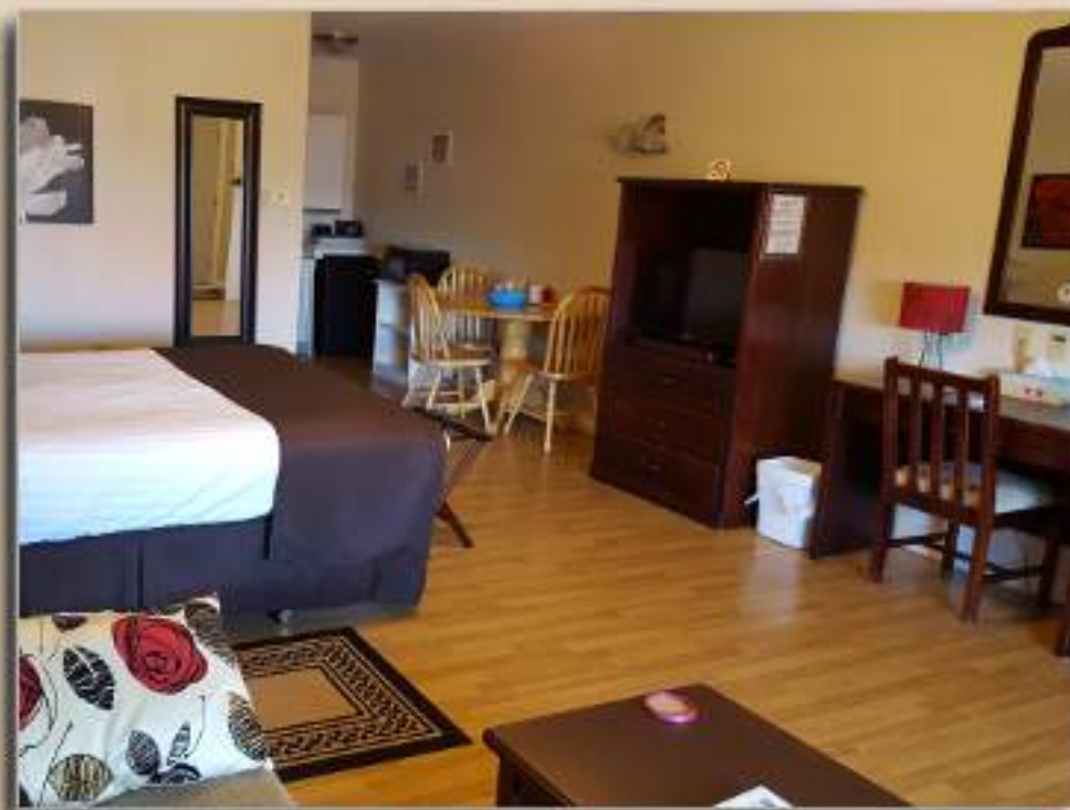
Suite #6 & 9