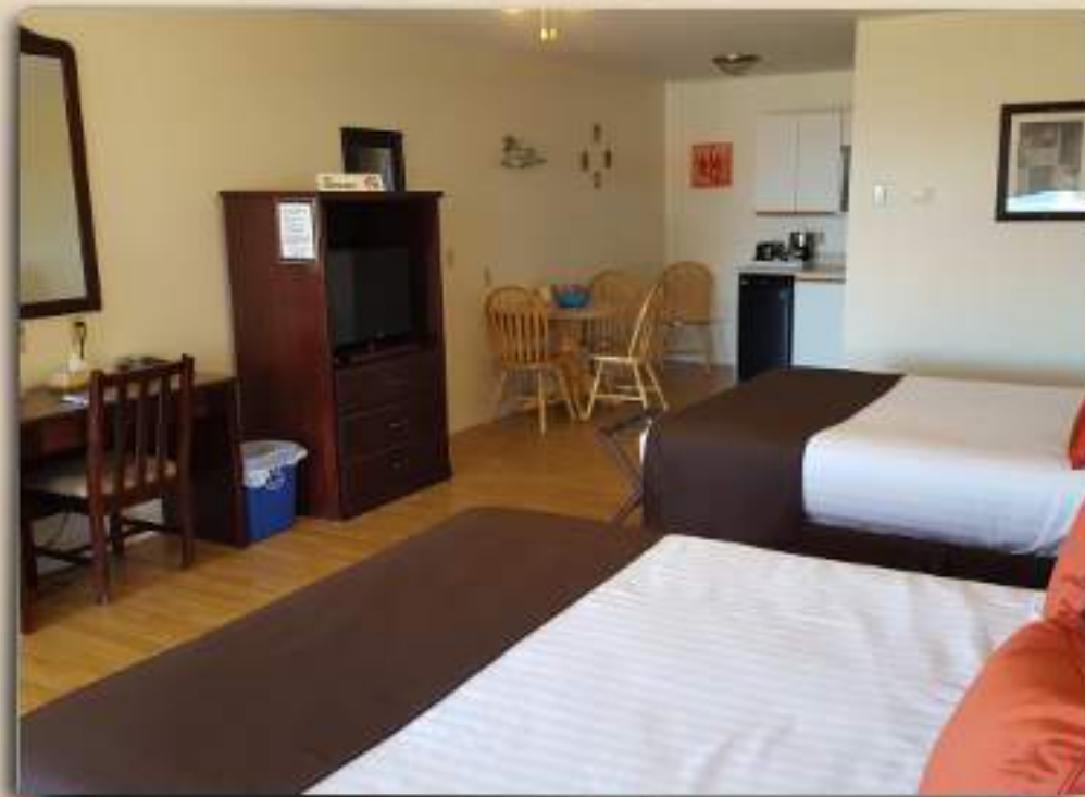
Suite #7 & 10