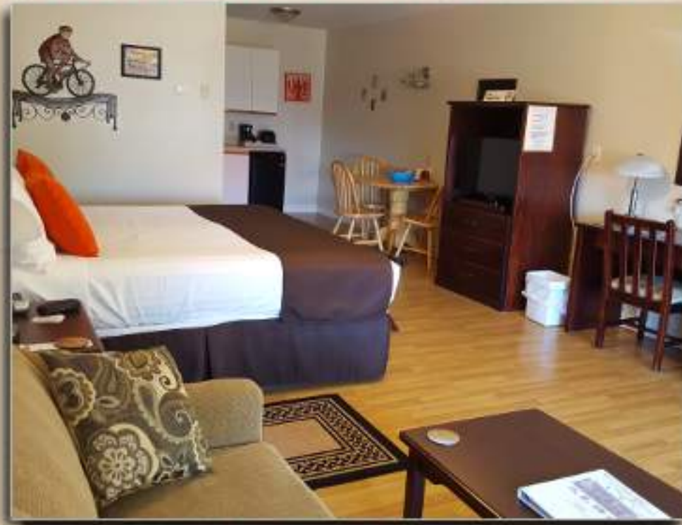
Suite #5 & 8